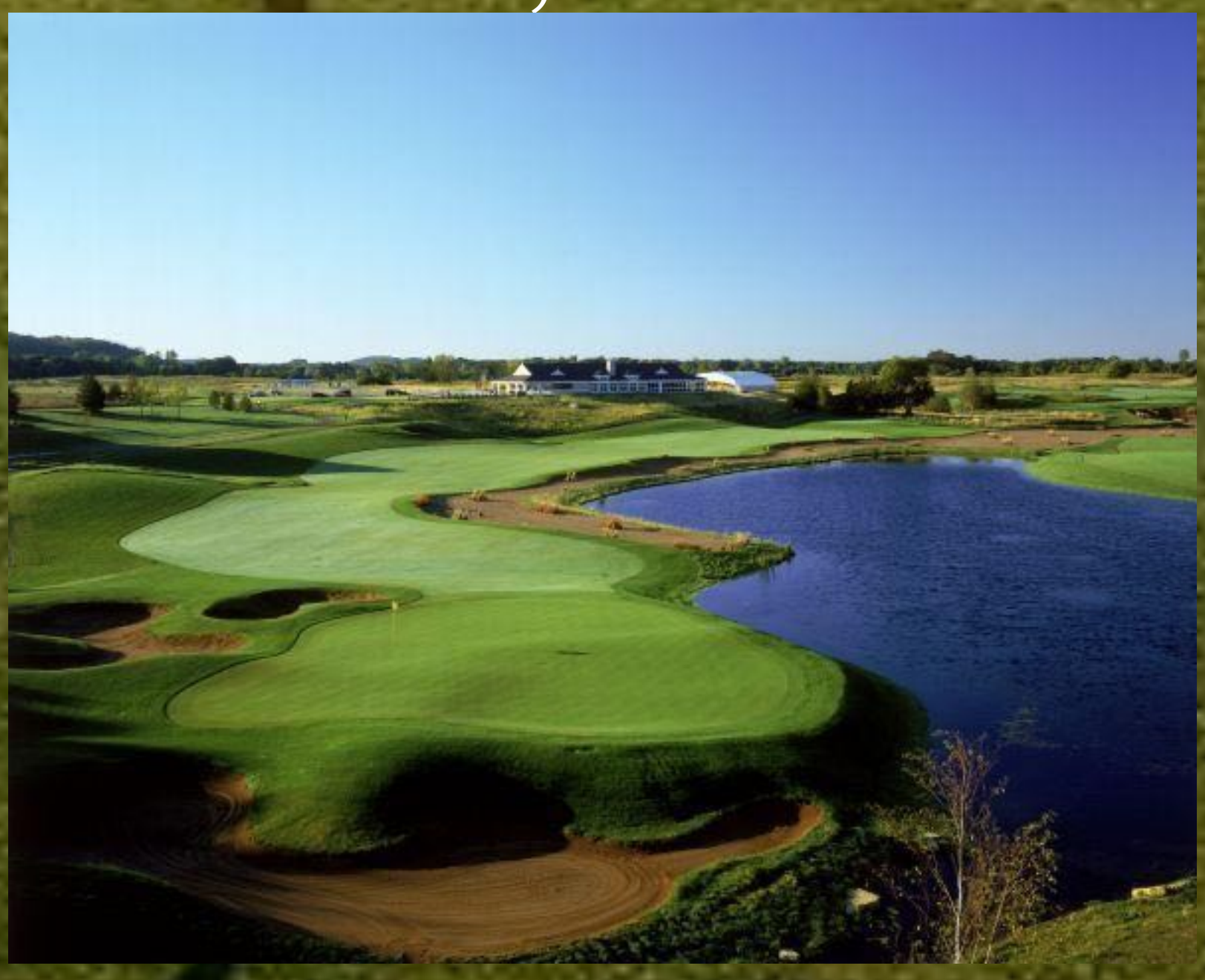
Asking Price - $7,500,000