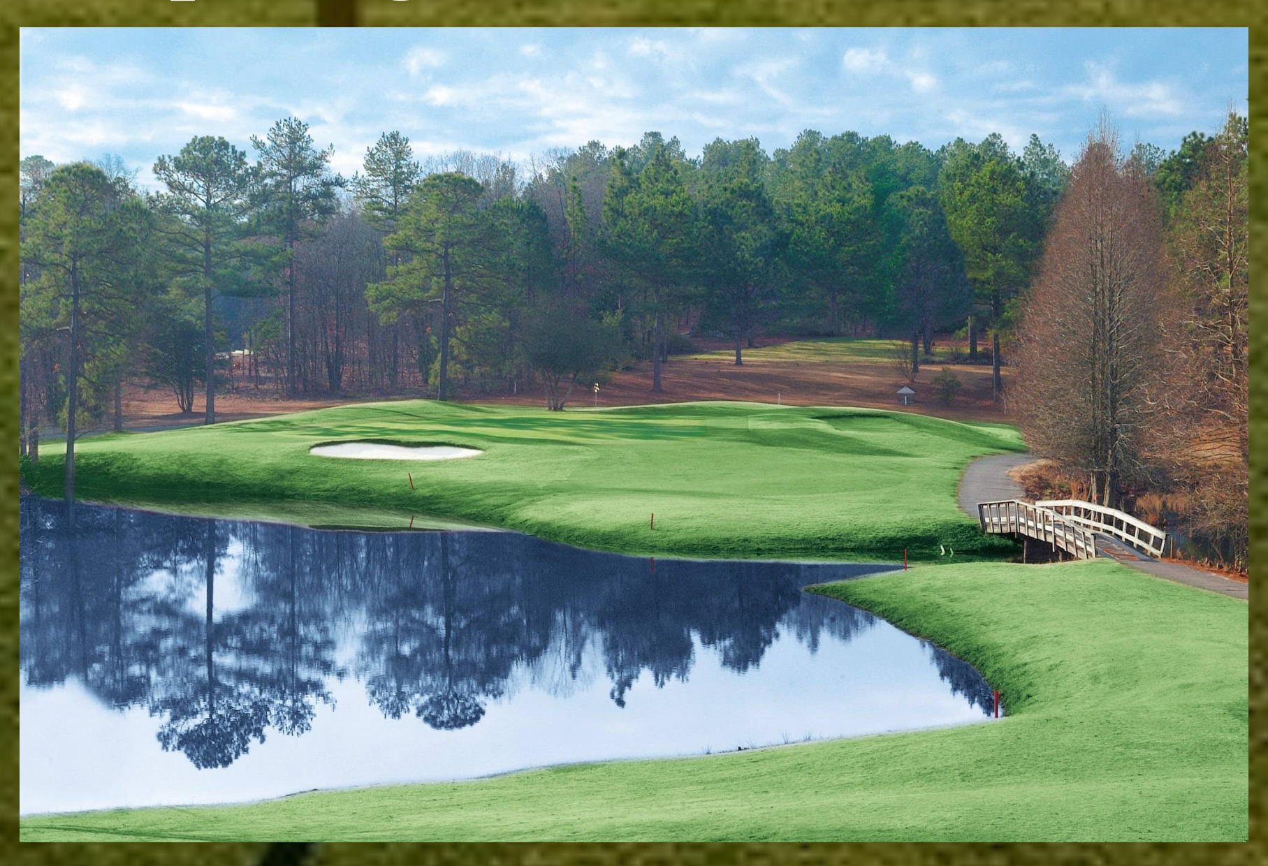
Asking Price - $1,000,000