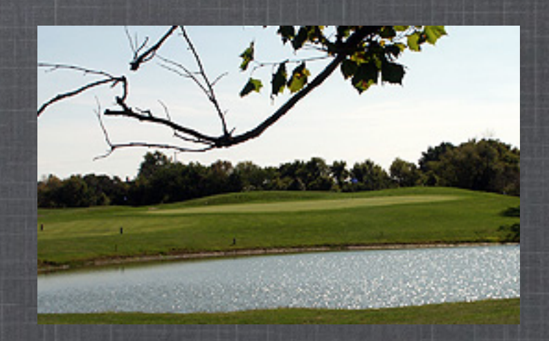
$500,000 Asking Price